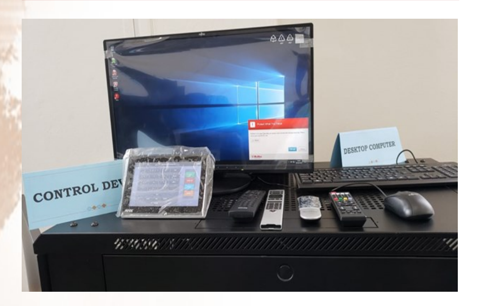
Some of the Audio-Visual equipment installed at the St. Catherine Parish Court.

The equipment was given through the Justice, Security, Accountability and Transparency (JSAT) programme, which seeks to improve processes and capacities within the justice and security sectors, thereby facilitating the reduction of case backlog and corruption as well as improving prosecutorial capacity.