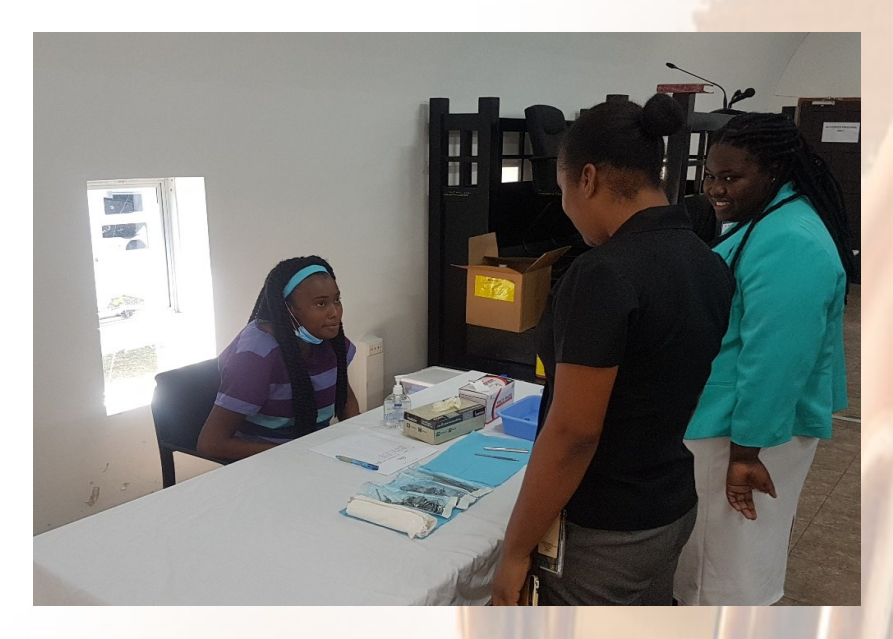
Staff members participate in a discussion with Court Optical Courts representative at the health fair.