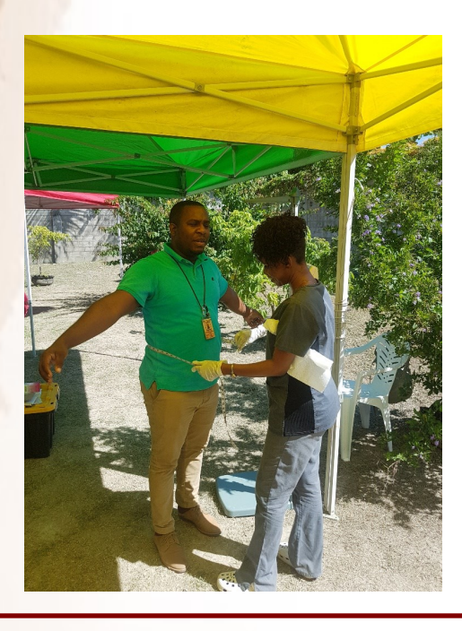
A CAD staff member gets his measurement taken by a representative from Foundation for International Self Help.

The initiative will continue at other parish courts to promote health and wellness in the court system.