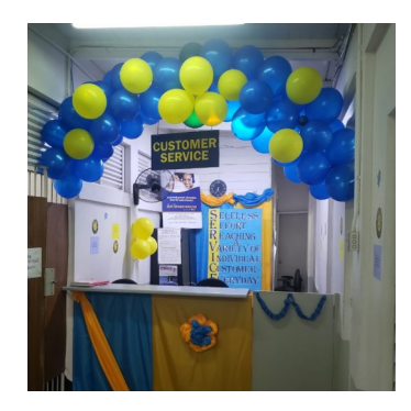
St. Mary Parish Court received Special Recognition in the Best Theme category.