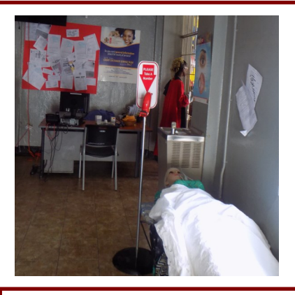
Kingston & St. Andrew Parish Court - Civil Division placed third in the Decorating category.