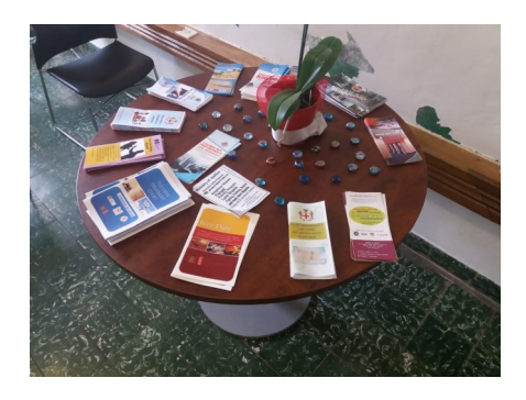
St. Catherine Parish Court won in the Best Public Education Corner category.