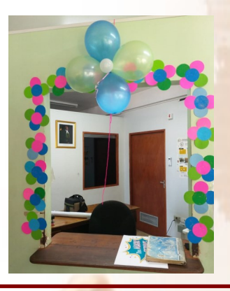
St. James Family Court decorated its offices in observation of NCSW 2019.