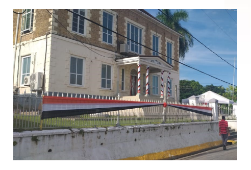
St. Ann Parish Court was second runner-up in the Best Theme category.