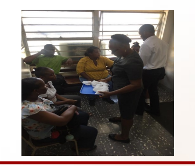
Customers at the Kingston and St. Andrew Family Court being served food during NCSW.