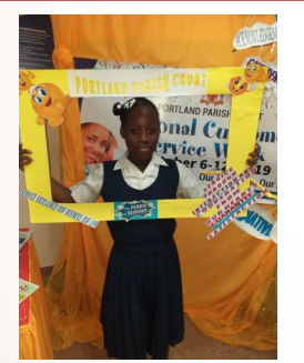
A student captured the moment using a selfie frame at the Portland Parish Court.